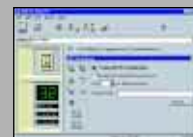
UPS Communications Software Offers Remote Management and Notification

ONEAC Total Protection protects all paths by which electrical disturbances can enter a system. Providing protection for communication lines and AC power protection, with or without battery backup, ONEAC Total Protection assures increased system reliability with far fewer interruptions or outages.