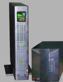
Uninterruptible Power Supplies